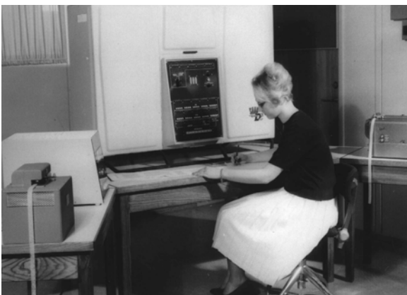
Figure 1. The D2 desktop computer

Saab was one of the first organizations in Sweden to use computers on a large scale. Aircraft design required extensive computing. Initially, women did this on desk calculators. Börje Langefors pioneered the use of punch card machines for matrix calculations. When BESK became available, Saab was one of the heavy users and soon built a copy, called Sara. These efforts meant that Saab early on acquired competence in software development. On a parallel line, in other parts of Saab, Viggo Wentzel designed a transistorized digital computer, aiming at an airborne version. The result was a prototype, one of the first transistorized computers in the world, called D2, which he demonstrated to the Swedish air force in 1960. It was a desktop computer; in fact, it covered the entire desktop. See Figure 1.